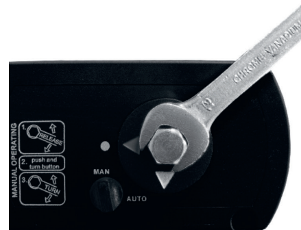
Should there be an electrical power failure, then the ball valve can be manually opened or closed.

Information provided herewith is believed to be accurate and reliable. However, no responsibility is assumed for its use or for any infringement of patents or rights of others, which may result from its use. In addition, JORC reserves the right to revise information without notice and without incurring any obligation