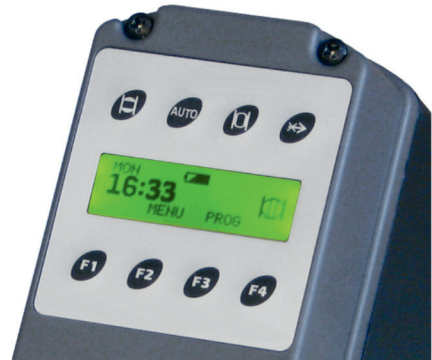
Built-in quartz controlled timer with LCD display