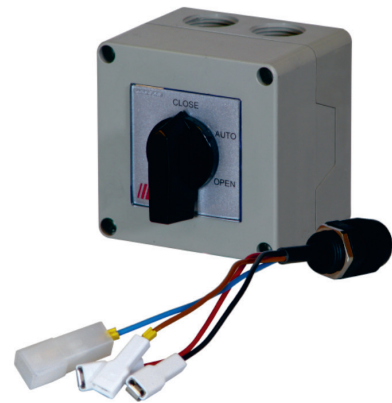
Remote control option.